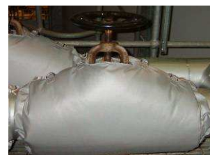
Removable heated jacket