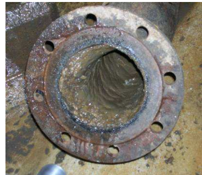
Build-up of fatty deposits in an unheated 200mm diameter STL